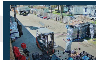
MDI AI Detection security camera identifies gun and possible intrusion at the back of El Ranchito grocery store